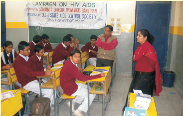
STD / HIV Awareness Program in Delhi Schools.

A child is born with fundamental rights to live in freedom, liberty, dignity and in loving care. Every child has the right to adequate food, clothing, shelter, education, medical care, protection and development with proper guidance. All children deserve healthy growth, quality education and adequate skills to making them independent to live a productive life.