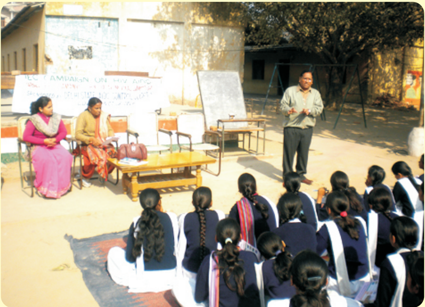
STD / HIV Awareness program for girls in East Delhi Govt. Schools

No other word engenders as much fear, revulsion, despair and utter helplessness as HIV/AIDS. Despite increased HIV/AIDS awareness, the terror persists. HIV/AIDS is rewriting medical history as deadliest scourge. Forty million deaths is a forecast in this millennium and the statistics tell their own sordid tale. As definite HIV/AIDS cure is still in the research stage, an increased HIV/AIDS awareness, counseling and alternative treatment is the focus of SSS programmes. Sexually transmitted diseases, prevention and cure is paramount and becomes the top priority agenda.