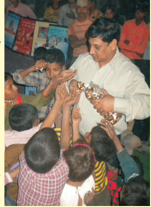
Sweets served to Delhi Street Children

SSS is a not for profit, non governmental and registered organization under the Societies Registration Act 1860 since 2003. It is a voluntary, welfare and community services organization. SSS also got a registration with 12AA and 80G. SSS Pancard no. is AAFAS6184F The aim is to motivate the communities in volunteer activities and help underprivileged children and meet their needs to become productive adults in the society at large.