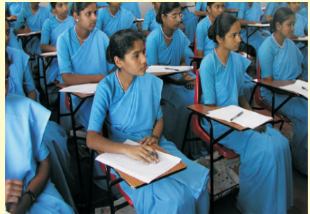
SSS & Citizens First Inc. Planning to run a Nursing College in India .