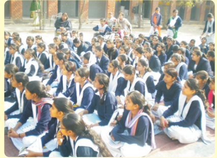
Seminar in East Delhi Secondary School girls on HIV/AIDS