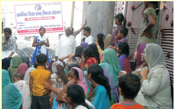
Community Meeting for Women Empowerment in Sri Ram Colony, North East Delhi