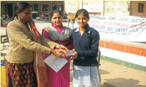
First place award to debator on STD / HIV Aids in East Delhi School