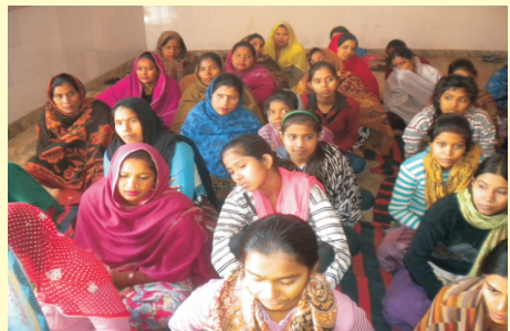
Women Empowerment Project