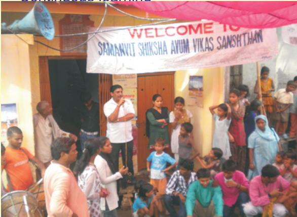
SSS Organized Health Awareness Program in East Delhi